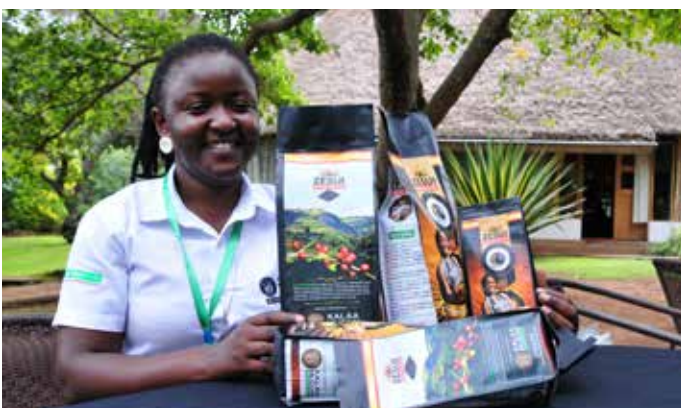
One of the youth beneficiaries of the FIEFOC program from Eastern Uganda