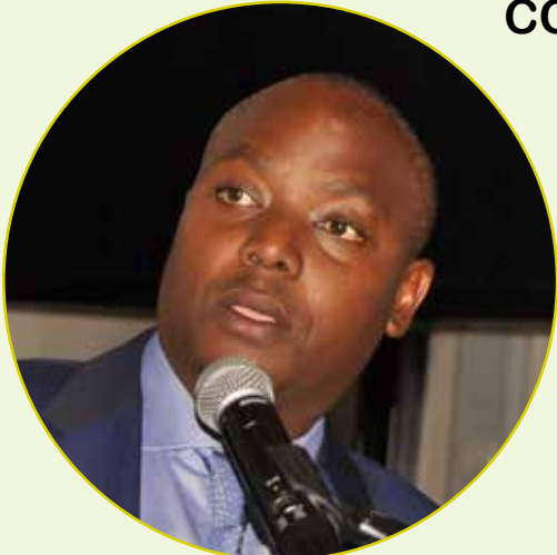
State Minister Kibule addresses a recent water sector gathering