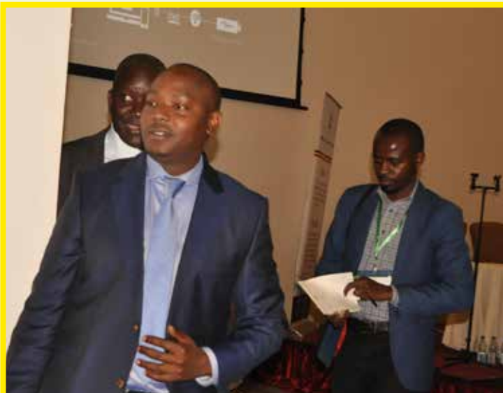
State Minister Ronald Kibule is in charge of the water docket