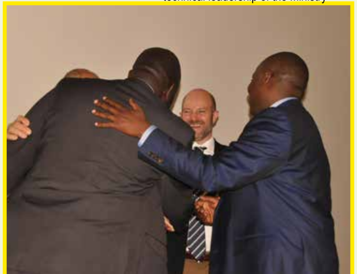
Water Ministry officials engage with donors during a recent public ceremony