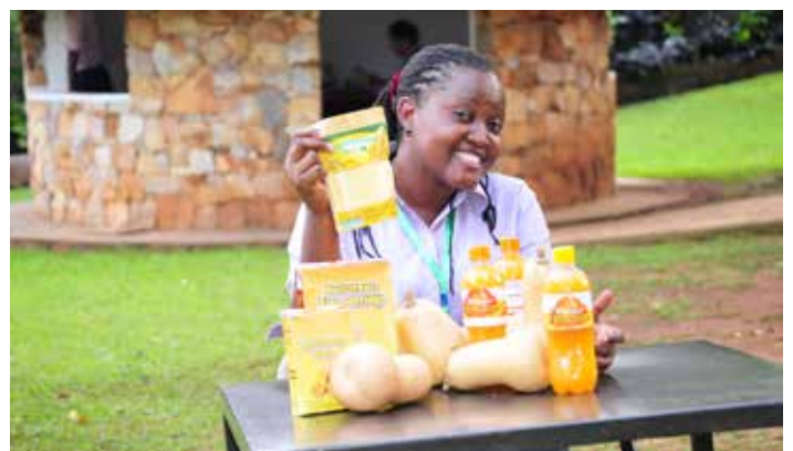
One of the youthful beneficiaries of the Enable Youth program in Eastern Uganda